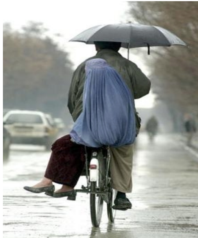
March 14, 2003

I dedicate this file to the memory of the countless Afghans just engaged in simple acts of everyday living across the vast and beautiful land of Afghanistan, who became the innocent victims of the horrific U.S. air and ground onslaught begun at 9 PM on October 7, 2001. Were they only able to ride a bicycle in the rain - or tears - of Kabul. Marc Herold, 03/15/2003.