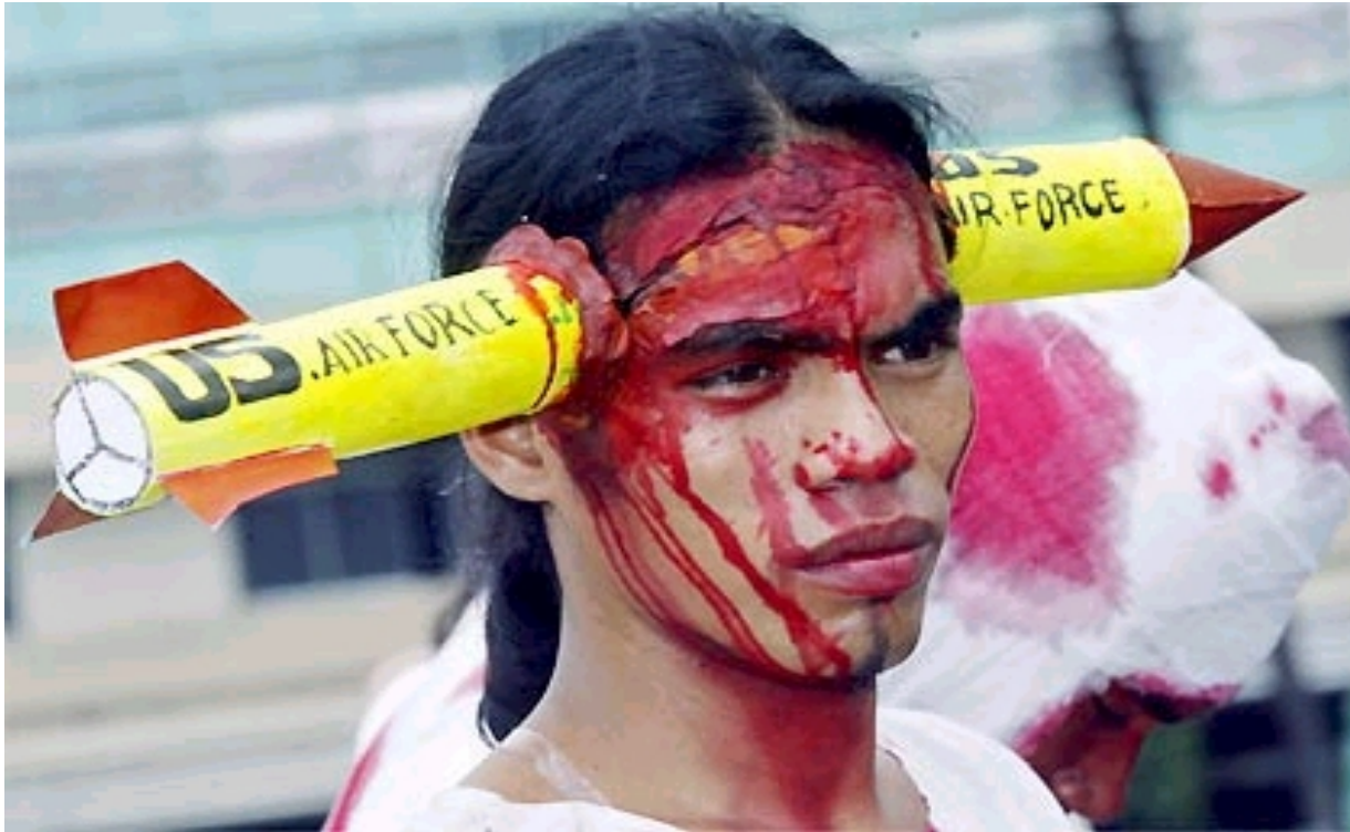
An Indonesian woman expresses her sentiments about the US Air Force's liberating role